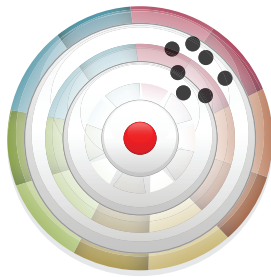
Reliable Not Valid