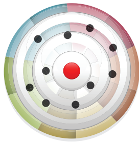
Not Reliable Not Valid

Reliability and validity are important concepts to evaluate when selecting a psychological assessment for use in your business. What follows is a simple and easy to understand summary of the reliability and validity evidence of the EQ-i 2.0®.