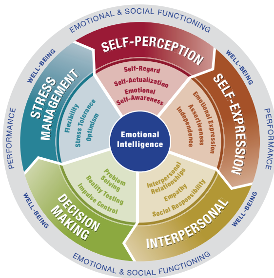
Copyright © 2011 Multi-Health Systems Inc. All rights reserved. Based on the original BarOn EQ-i authored by Reuven Bar-On, copyright 1997.

The EQ-i 2.0 model of Emotional Intelligence breaks EI down into 5 composite scales that all influence work in a healthcare setting in unique ways.